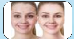
Dry Skin Soft Skin