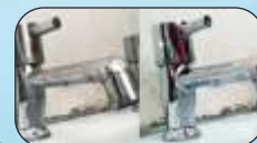
Stains on taps No stains on taps