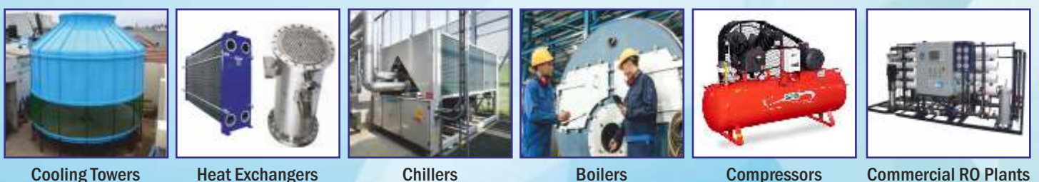
Cooling Towers Heat Exchangers Chillers Boilers Compressors Commercial RO Plants