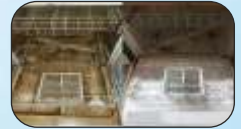
Before Dish Washer After Dish Washer