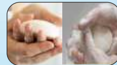
Less Lathre More Lathre