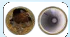
Pipe with limescale Pipe without limescale