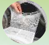
Sparkle clean wash