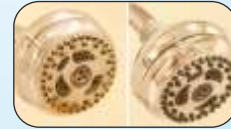
Clogged Shower head Unclogged Shower head