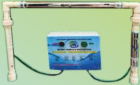
Advanced Electronics Water Conditioner