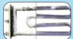
Before Heater After Heater