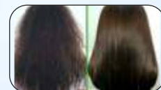
Dry Hair Smooth Hair