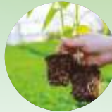
Better and fast healthy growth of Plants